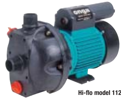
Hi-flo model 112

The 112 (moulded construction) and 252 (cast iron construction) provide higher head than the 400 series. This suits those jobs involving greater distances or more rugged terrain where a compact water transfer pump is required.